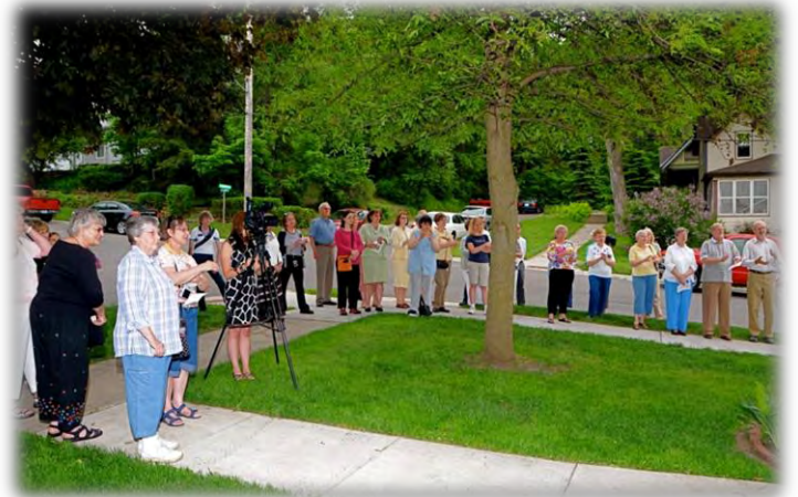
Crowd gathered for the dedication at Tacy's house.