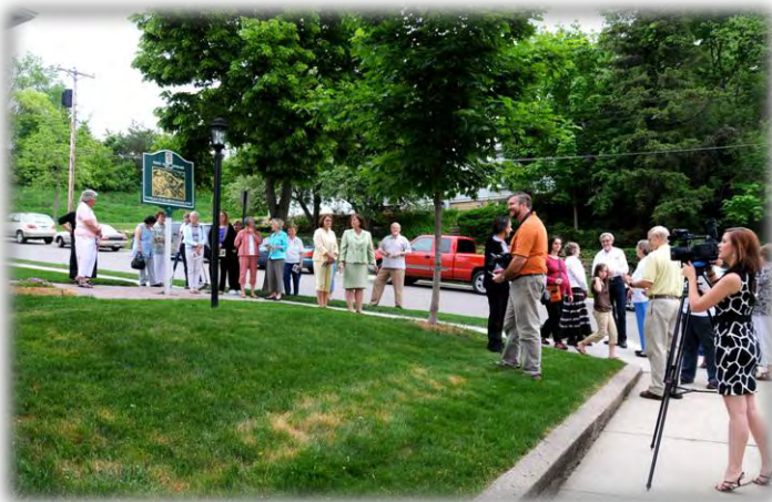
Crowd gathers for the dedication at Betsy's House.