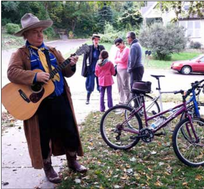
Mankato River Ramble