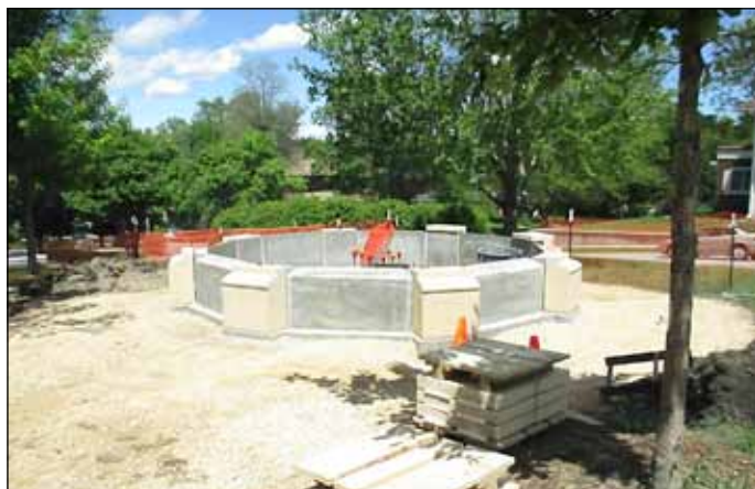
Ground pool base construction of the new "Boy in Blue" Blue Earth County Civil War Memorial in Lincoln Park, Sept. 2013.

Maud Hart Lovelace grew up several blocks from Lincoln Park in Mankato. The little park and the "Boy in Blue" fountain and monument were an important landmark in Maud's "Deep Valley". Maud and her friends stopped to play there when they walked downtown, and she referred to Lincoln Park several times in the Betsy-Tacy books, writing " Lincoln Park was a pie-shaped wedge of lawn with a giant elm tree and a fountain on it. "