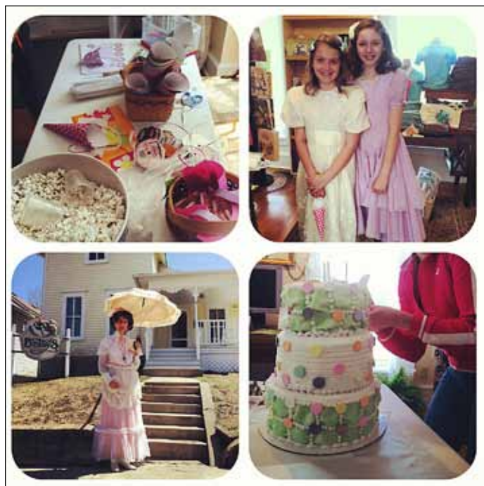
Betsy's Birthday Party

April 6 & 7 - Barnes & Noble Book Fair. Costumed young actresses portrayed Betsy and Tacy.