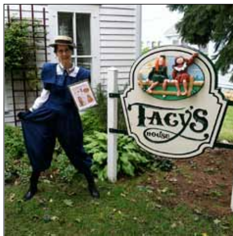
Mankato River Ramble

July 13 - Tacy's Birthday Party: Cupcakes, games, colored sand crafts.