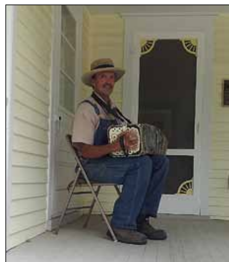
Lincoln Park Lawn Party