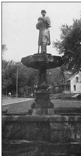
Boy in Blue 1909

Maud Hart Lovelace grew up several blocks from Lincoln Park in Mankato. The little park and the "Boy in Blue" fountain and monument were an important landmark in Maud's "Deep Valley". Maud and her friends stopped to play there when they walked downtown, and she referred to Lincoln Park several times in the Betsy-Tacy books, writing " Lincoln Park was a pie-shaped wedge of lawn with a giant elm tree and a fountain on it. "