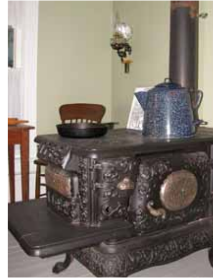
The stove in Betsy's kitchen is an example of an item on loan to the BTS. It is a prized piece in place to enhance the interpretive experience of visitors — especially children.

The Betsy-Tacy Society's collection of artifacts and keepsakes has benefited from the interest and support of many friends and fans over the years. The society has gratefully accepted those donated items. Now it has a plan in place to give those generous individuals the recognition they deserve. ■