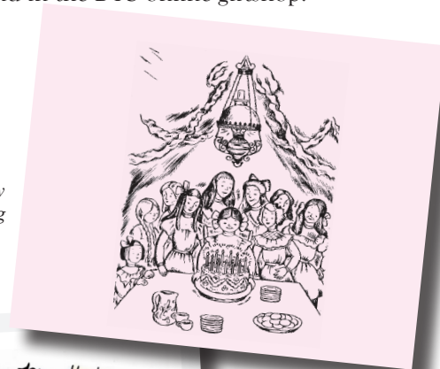
Illustration by Lois Lenski. Blank note card folded with envelope. (5-1/2" x 4-1/4") Pale pink card stock. Back of card has quote from Betsy and Tacy Go Over the Big Hill . Perfect for birthday party invitations! $7.50 per package of 6.