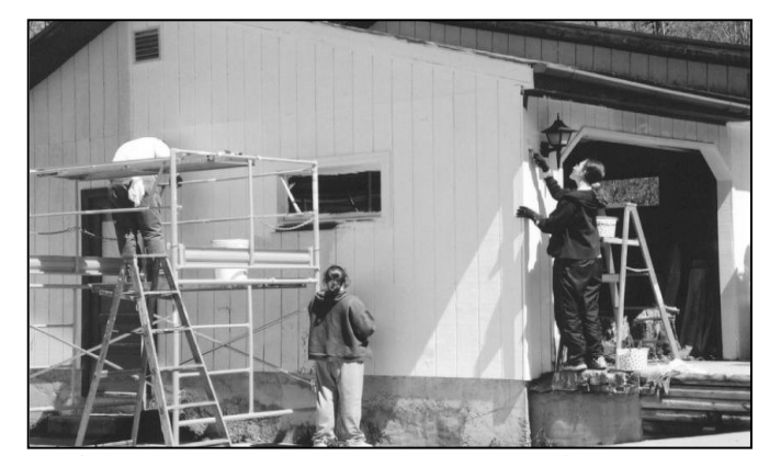
wonderful volunteers who helped us accomplish a

Jobs included cleaning out Tacy's garage, separating lumber, taking off paneling from front parlor at Betsy's, removing interior walls from Betsy's porch, scraping and painting Betsy's garage. We wish to thank our