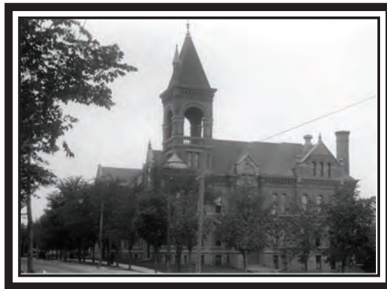
Mankato High School, ca. 1910 Deep Valley High School