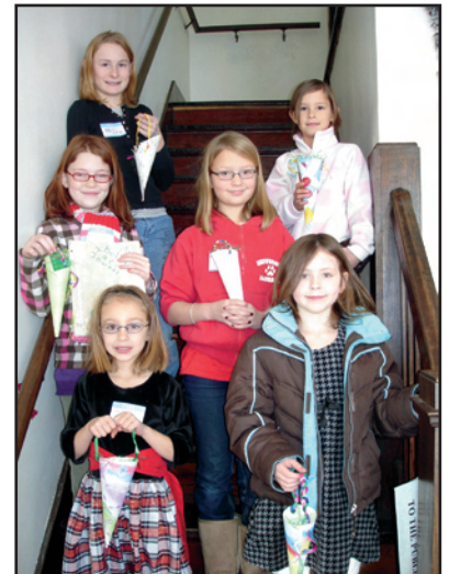
Betsy-Tacy Book Club members, January 2010.

In the next issue of the Deep Valley Sun: Part 2 of the history of the Betsy-Tacy Society