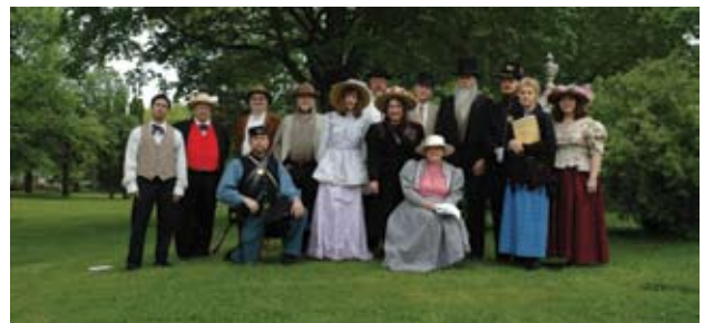
2006 Glenwood Cemetery re-enactors.

A donation of $3.00 per person or $5.00 per family is requested. Refreshments will be available at the end of the tour.