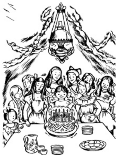
Illustration by Lois Lenski © HarperPerennial Modern Classics