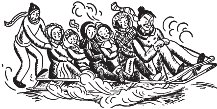
Illustration by Lois Lenski

Winter in Deep Valley really begins with the first snowfall of the season, which is eagerly anticipated by children and adults alike. A fresh coat of white, glistening snow covers the otherwise brown, barren trees and lawns. The snow brightens our spirits as thoughts of winter fun await.