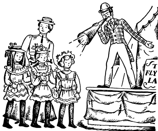
Illustration by Lois Lenski © HarperPerennial Modern Classics

http://betsytacysdeepvalley.wordpress.com/