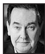
CAL THOMAS Fox News

Direct all MAIL for Cal Thomas to: Tribune Media Services, 2225 Kenmore Ave., Suite 114, Buffalo, N.Y. 14207. Readers may also e-mail Cal Thomas at tmseditors@tribune.com .